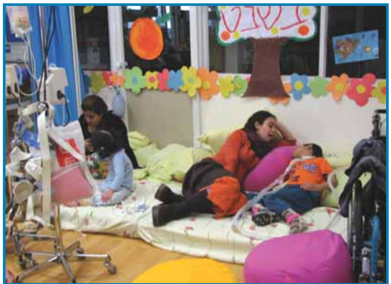
Heart to heart conversations and quiet activities during “resting time”.