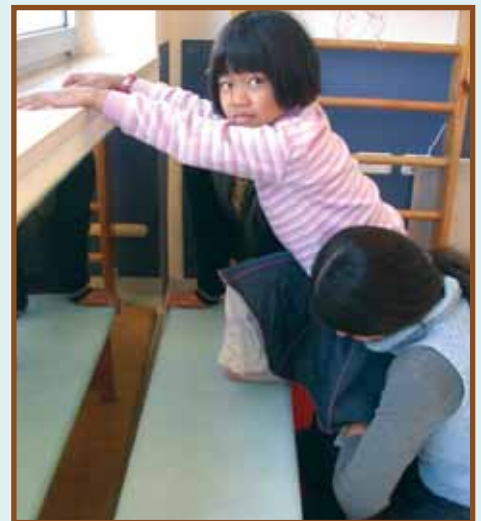
Atara from the BNAI MENASHE community.