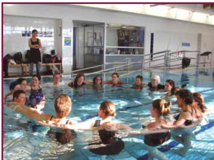
Seminar participants enjoying a practical session in Alyn's therapeutic pool.